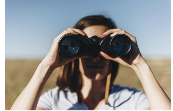
Search and Assess