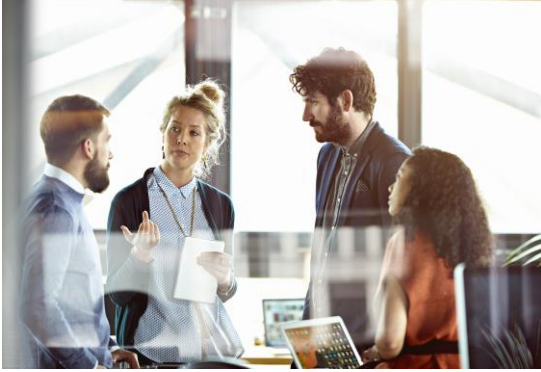
Experienced Change Partner