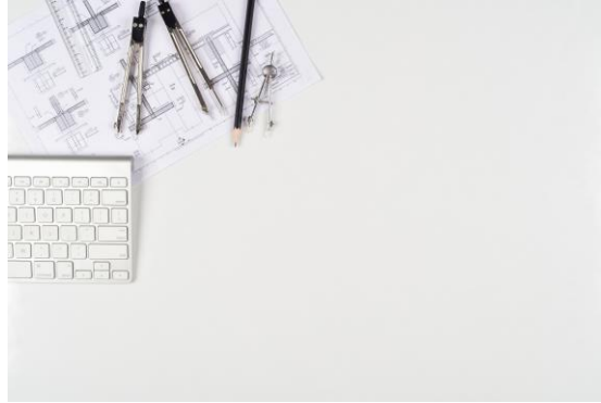
Discover and Design