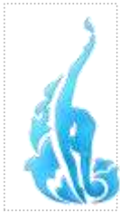
FIG RHYTHMIC GYMNASTICS WORLD CHALLENGE CUP KAZAN (RUS) 11 – 13 AUGUST 2017 INDIVIDUAL AND GROUP